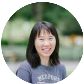
Cici, China Masters in English Language Studies (Coursework)

"I am doing a coursework-based Masters' because I felt like it would be better suited for my future plans. I've gained significant knowledge that will be valuable in the future job market. I'm really happy with the study experience in Malaysia."